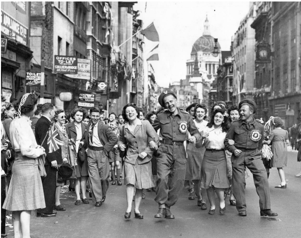
VE Day celebrations in London: 8 May 1945.