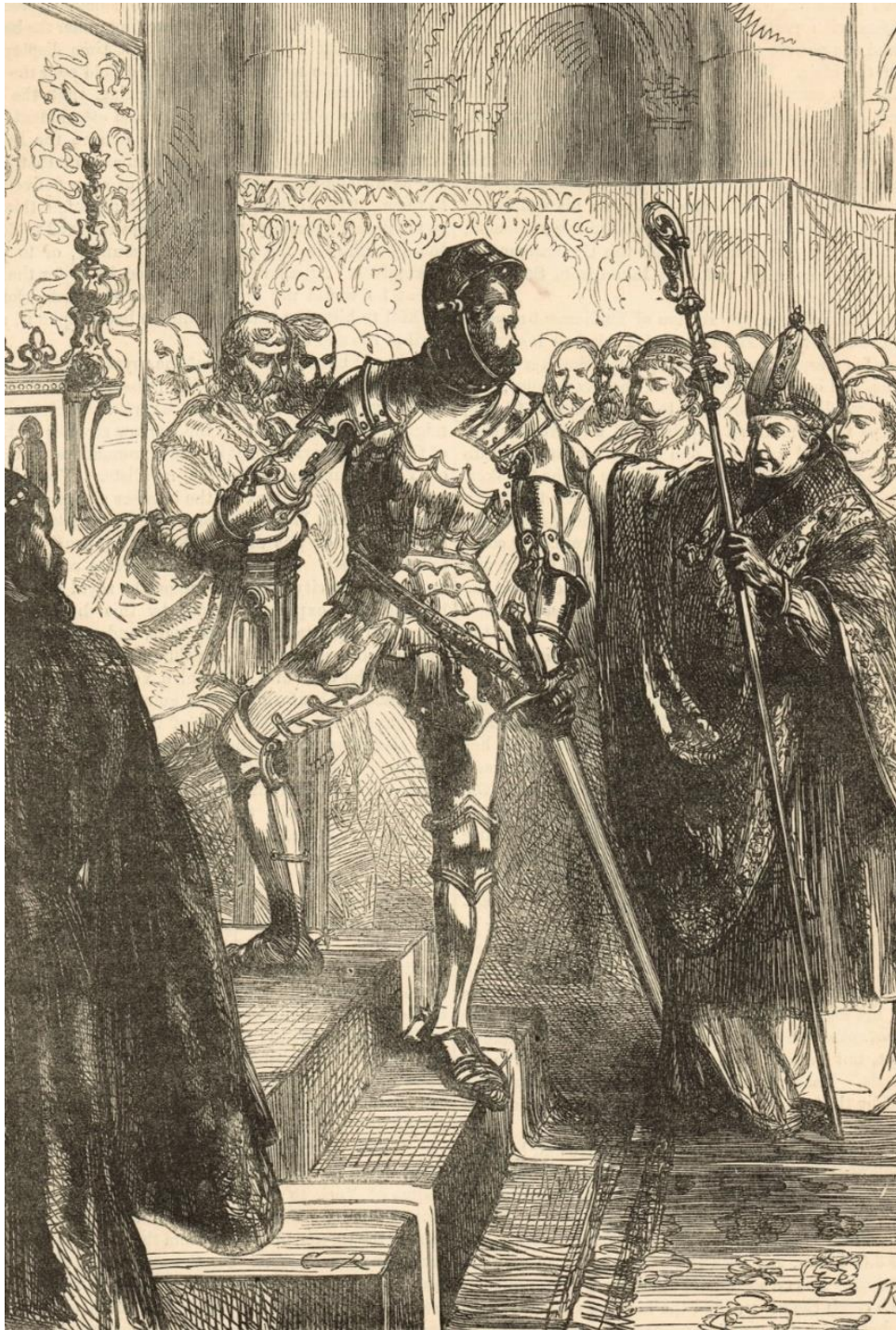
Richard claims the Throne of England for the House of York. Autumn 1460.

Within two years of the Loveday procession, most of the participants would be dead. The Wars of the Roses would rage on for nearly three more decades.