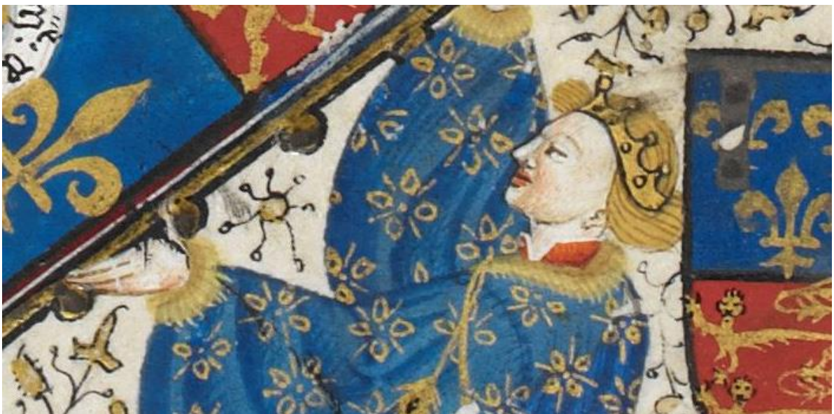
Richard, Duke of York.

However, Margaret and the Beauforts seem to have regarded him as a threat from early on. They would become Richard's implacable enemies steadily forcing him into a position where open rebellion became more and more likely. Perhaps even inevitable.