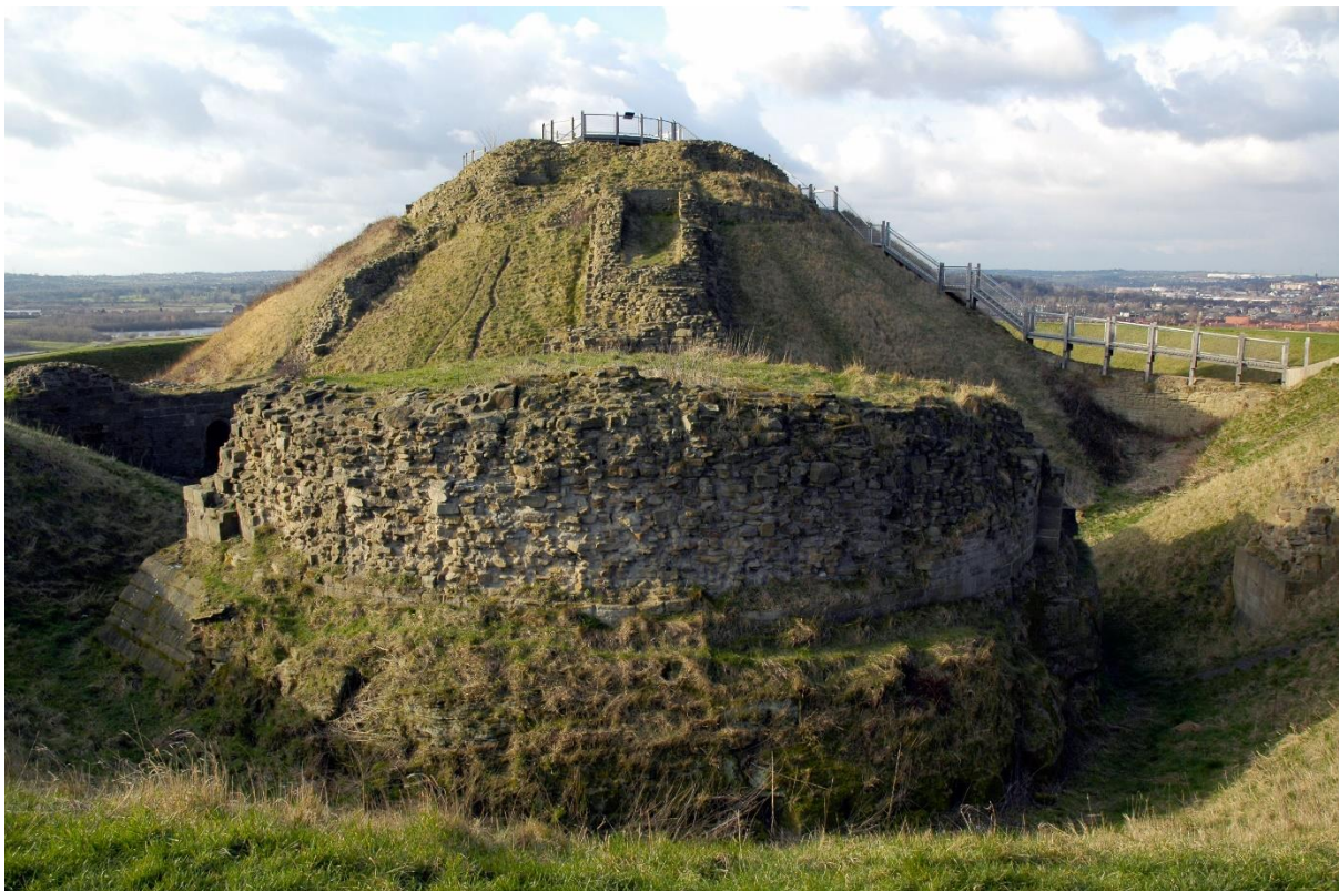
The ruins of Sandal Castle at Wakefield West Yorkshire. The scene of the Battle of Wakefield on 30 December 1460 where Richard Plantagenet Duke of York fell.

It replaces an older monument set up by Edward IV to the memory of his father, which was destroyed by Parliamentary forces during the Civil War.