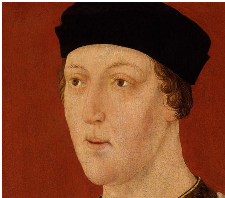
King Henry VI.

Both suffered from mental impairments that hindered their ability to rule effectively; both were easily controlled by more powerful, ambitious figures. Both oversaw the descent of their kingdom from its zenith into a bloody civil war; both were later murdered; both were the last of their royal dynasties to assume the kingship.